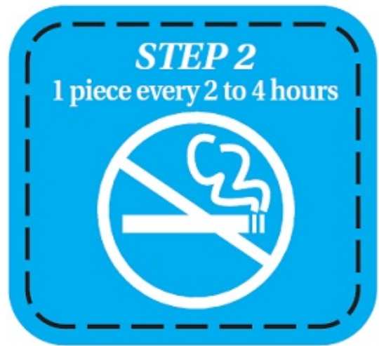
At the Beginning of Week #7