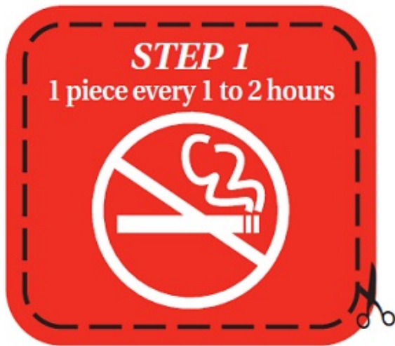
At the Beginning of Week #1 (Quit Date)