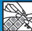
To remove the gum, tear off single unit