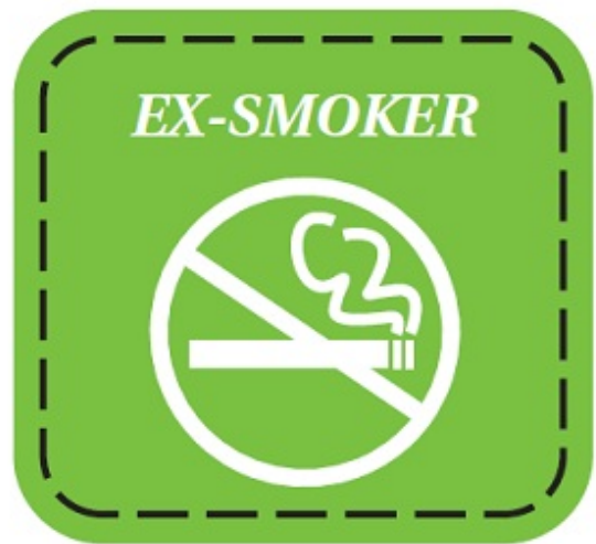
12 Weeks After Quit Date