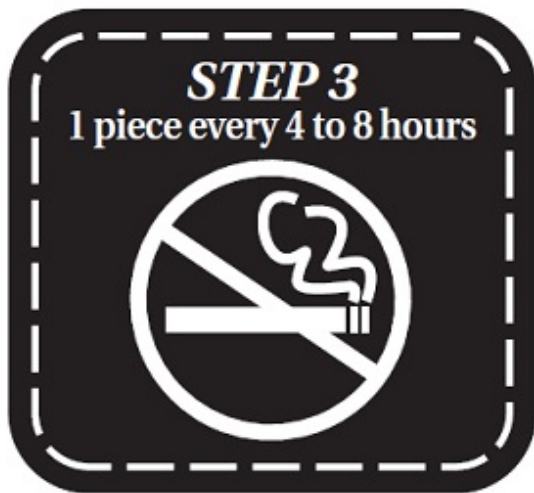
At the Beginning of Week #10